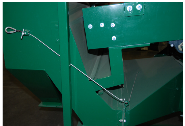
Bottom Air Chamber Adjustment Cable

Southey, Sk Box 280, S0G 4P0 Toll Free: 1-888-235-2626 Phone: (306) 726-4403 Fax: (306) 726-4409