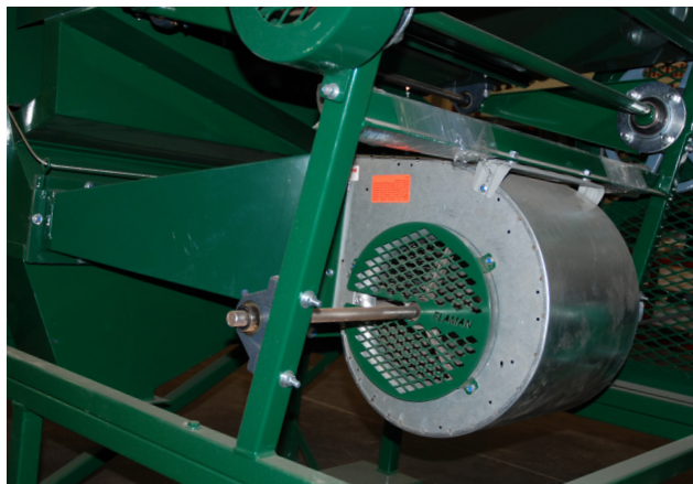
Bottom Air Chamber

The screened grain then goes through the bottom air chamber in which the product will go through a stream of air to blow out any lighter foreign material. This air system is adjustable through a damper control on the fan discharge chamber. This is to be checked to make sure just enough air is used to separate the light foreign material from the good product. It is typical to lose a small amount of good product material in the process. Remember, if you don't lose some good product, there will be foreign material staying with your product. Air is adjusted by controlling the air damper and locking it in position.