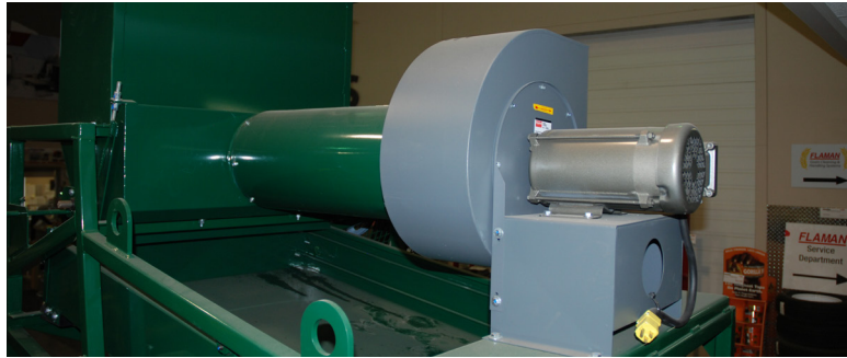
Top Air Aspirator

The AS4 comes with a top air aspirator which pre-cleans the light chaff from the product before the screening process. The top air is adjusted by opening the damper just enough to vacuum off dust and small particles without disturbing any seed. Remember you have the final air chamber to go through to separate out the balance that is left.