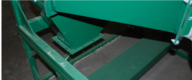
Cleaned Product Discharge Chute

The cleaned product discharge is located to the front behind the heavy air separation discharge.