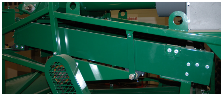
Top Shoe (Deck)

The top shoe, or deck, contains: two screens, one top scalper screen, and a bottom fine sifting screen. The top screen will scalp off any large foreign debris away from your product and go into the side discharge chute. Your scalped product will fall through the scalper screen and onto a fine sifting screen, which will sift out any smaller debris, weed seeds, and other material away from the product you are cleaning. It is always important to use the proper size screens for the product in which you are cleaning. Enclosed there is a seed screen size chart showing suggested sizes to clean common commodities. The decks or shoe have an adjustment hanger. Always make sure decks are level in operation. The adjustment will adjust the tilt of the flow to either lengthen the time on the screen (flatten) or tilt up to shorten the length of time on the screen. Always make sure that the screen decks are level before operation to make sure there is no sideways motion on the decks. A level would work best for this.