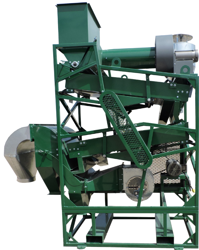
Shown With Optional Air System Kit

Southey, Sk Box 280, S0G 4P0 Toll Free: 1-888-235-2626 Phone: (306) 726-4403 Fax: (306) 726-4409