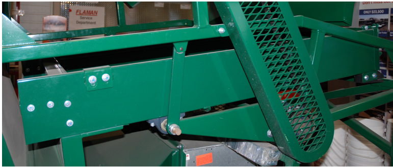
Bottom Shoe (Deck)

The bottom shoe deck also contains two screens, a scalper screen, which is sized one size smaller than the top deck scalper screen, and a fine sifting screen. The process is repeated to further size your product. The same design for adjustments are used on the second deck, again make sure the screen deck is level.