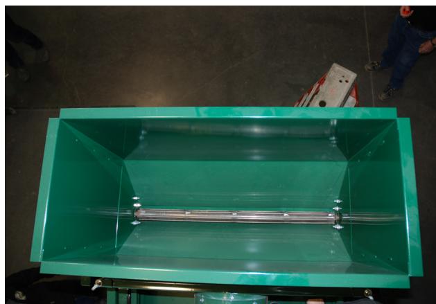
Hopper Inlet (Interior) - Ant-Clog Feed Roll

Southey, Sk Box 280, S0G 4P0 Toll Free: 1-888-235-2626 Phone: (306) 726-4403 Fax: (306) 726-4409