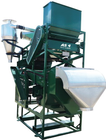
Optional Air System Kit Available