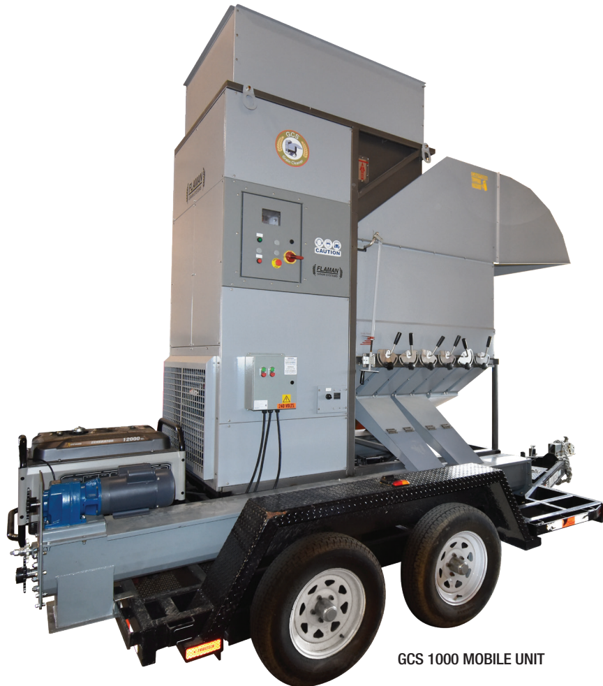
GCS 1000 MOBILE UNIT