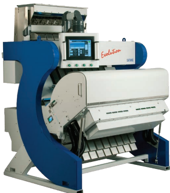
Evolution 400 & 800